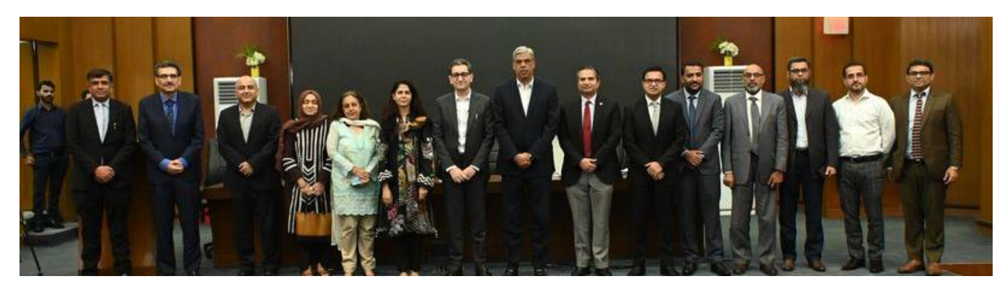
Stakeholders' consultation session held with Audit Firms on September 14 2023 at Karachi

Stakeholders' consultation session held with companies on September 07 2023 at Karachi